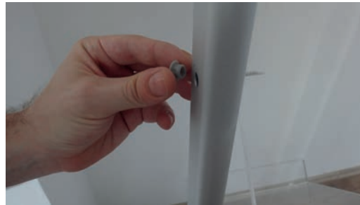
Assemble the acrylic structure to the aluminium pole