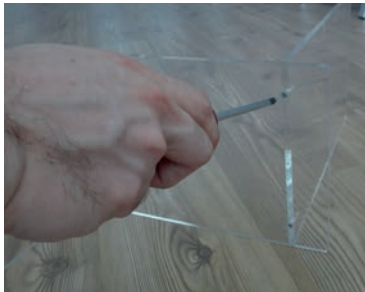
Assemble the acrylic shelves to each other